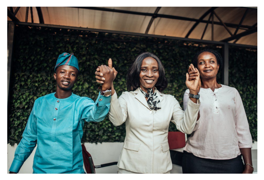
Business mentors and mentees with disabilities meet as part of Inclusive Futures supported work in Nigeria.

With an influential network of member hotels, the Alliance has a wide reach in the hospitality sector, representing over 50,000 properties and 7 million rooms globally. This partnership combines the Alliance's expertise and global network with Sightsavers' experience fighting for disability rights for more than 70 years.